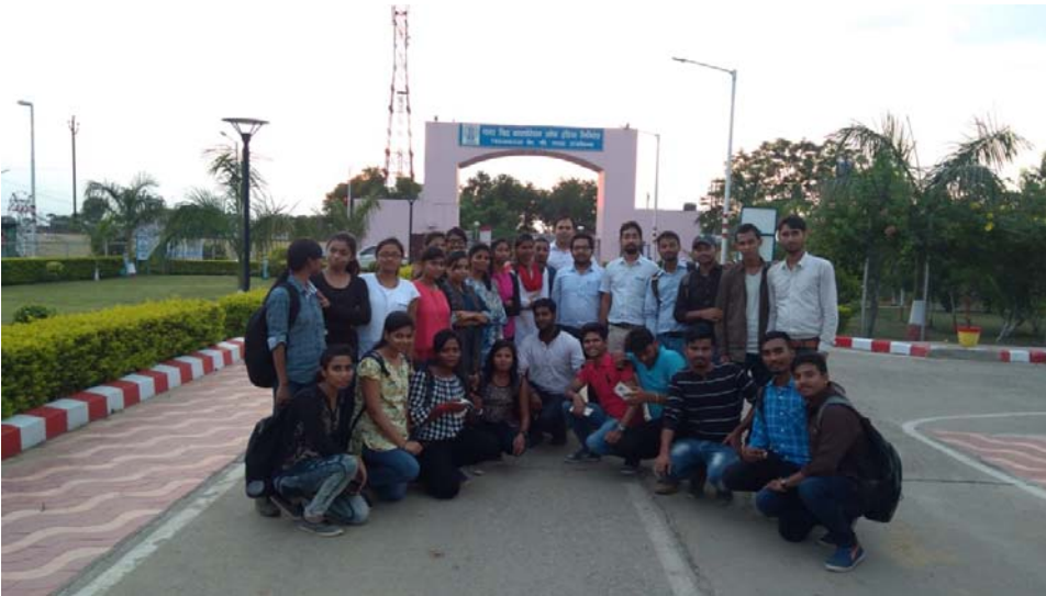
Power Grid Corporation of India