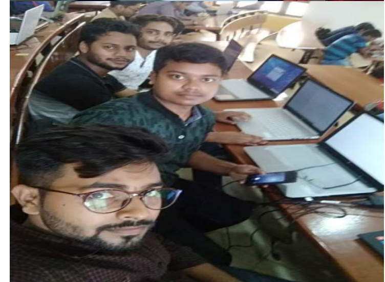
Android app development and machine learning , at IIT KGP